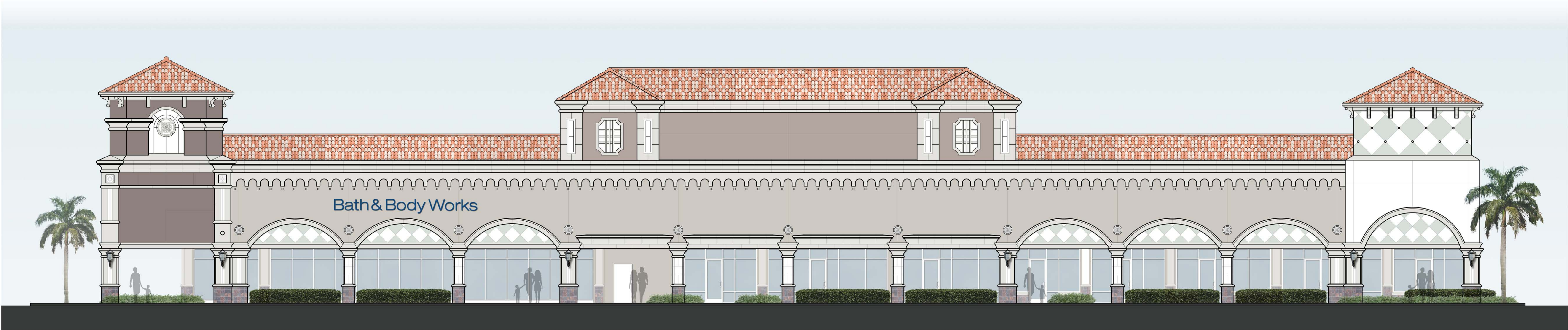
② Building 'A' - West Elevation SCALE: 1/8"=1'-0"

DRAWING NOTES • THESE DRAWINGS ARE TO CONVEY DESIGN INTENT ONLY AND ARE NOT INTENDED FOR PERMITTING OR CONSTRUCTION PURPOSES. ALL DIMENSIONS SHOWN ARE FOR REFERENCE PURPOSES ONLY AND ALL INFORMATION, INCLUDING DIMENSIONS (SCALED OR OTHERWISE) SHALL BE VERIFIED IN THE FIELD PRIOR TO RELIANCE ON SUCH INFORMATION SHOWN OR OTHERWISE DERIVED FROM THESE DRAWINGS. • RADAKOVICH ARCHITECTURE ASSUMES NO LIABILITY RESULTING FROM RELIANCE ON THE INFORMATION SHOWN OR THE USE OF THESE DRAWINGS.