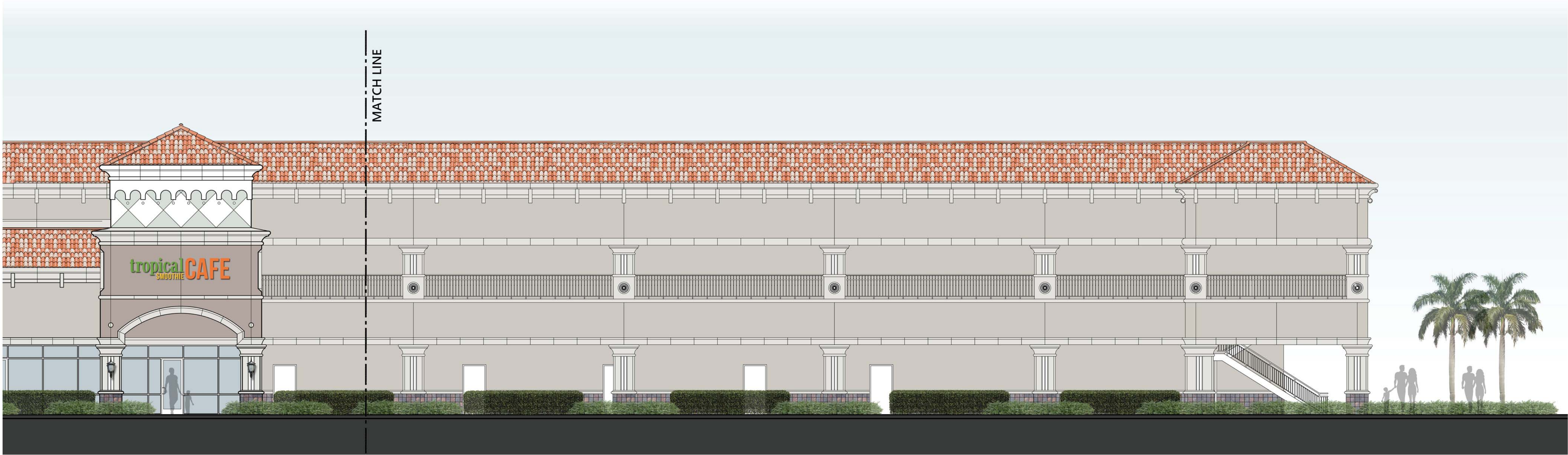
② Building 'B' - Partial East Building Elevation SCALE: 1/8"=1'-0"

DRAWING NOTES • THESE DRAWINGS ARE TO CONVEY DESIGN INTENT ONLY AND ARE NOT INTENDED FOR PERMITTING OR CONSTRUCTION PURPOSES. ALL DIMENSIONS SHOWN ARE FOR REFERENCE PURPOSES ONLY AND ALL INFORMATION, INCLUDING DIMENSIONS (SCALED OR OTHERWISE) SHALL BE VERIFIED IN THE FIELD PRIOR TO RELIANCE ON SUCH INFORMATION SHOWN OR OTHERWISE DERIVED FROM THESE DRAWINGS. • RADAKOVICH ARCHITECTURE ASSUMES NO LIABILITY RESULTING FROM RELIANCE ON THE INFORMATION SHOWN OR THE USE OF THESE DRAWINGS.