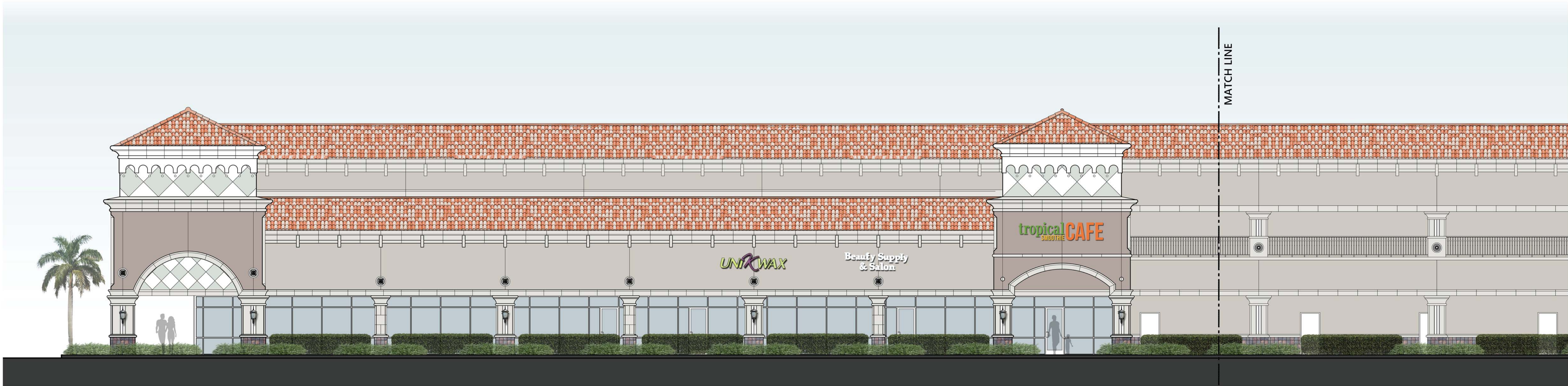
① Building 'B' - Partial East Building Elevation SCALE: 1/8"=1'-0"